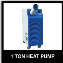
1 TON HEAT PUMP